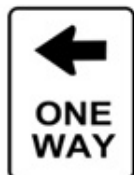
THIS WAY ONLY