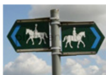
FOLLOW THE BRIDLE PATHS