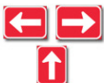
STAY IN THIS DIRECTION